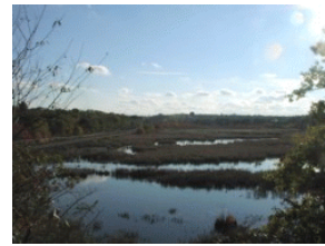
View over Thompsons Meadow

You reach Salem Woods most conveniently through a trail next to a large wooden sign at the back of the